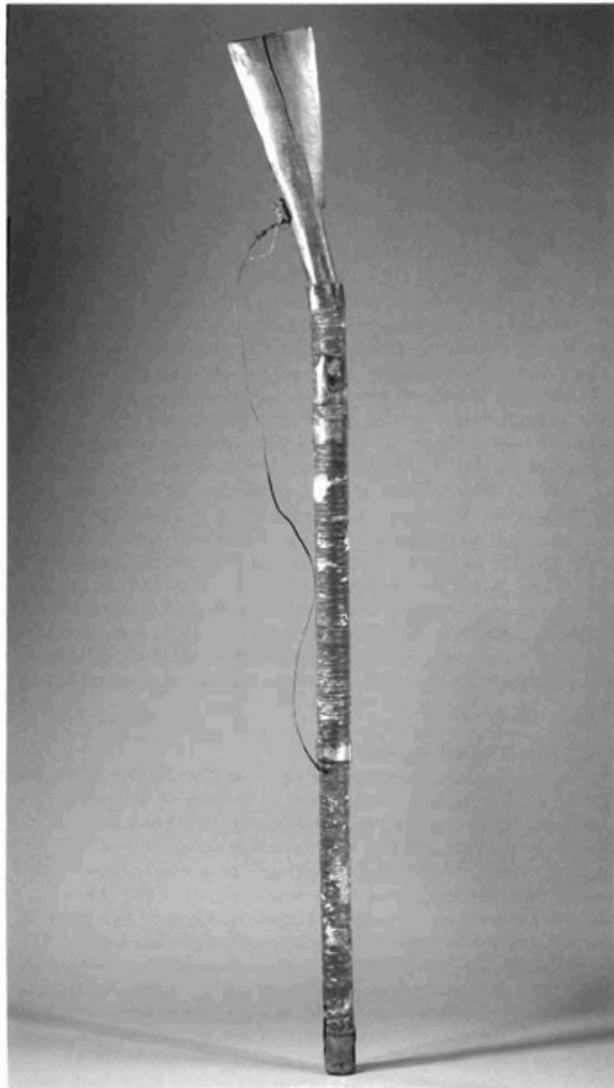
Figure 5 The 'Homemade Filipino Rifle' appearing in a case devoted to the Philippine War. (National Museum of American History)