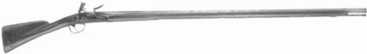
Figure 1 American-made composite musket from the Revolutionary War, assembled with a barrel bearing London proofmarks, a lock bearing French marks and the trigger and stock of an American manufacturer.

war, of the material culture of the soldier. Each one of these functions places certain demands on the exhibition and on the visitor.