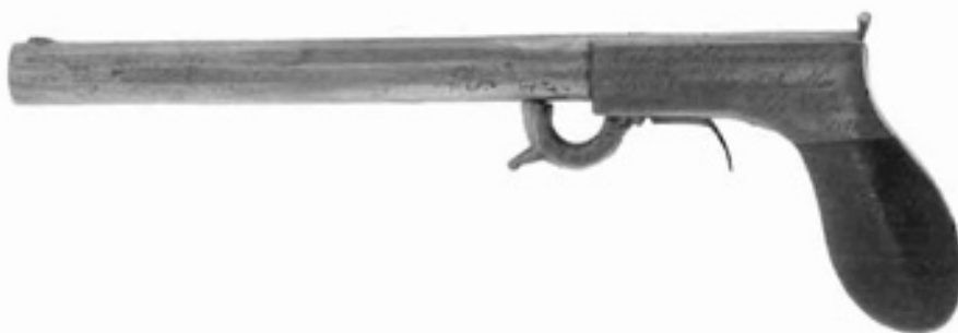
Figure 4 A nineteenth-century pistol made by Salola, a blacksmith in the Oconaluftee Cherokee settlement of Quallatown, North Carolina. (National Museum of American History)

all, was America's first photographed war) projected on the wall above some exhibition cases. Indeed, the Civil War section, the first that features war photography (itself not more than a half-dozen years old when the war began in 1861), marks an interesting shift in the exhibition. From this point the exhibition's objects and other graphics compete, often unsuccessfully in terms of emotional effect, with the stark images – black and white until the last few decades of the twentieth century – of soldiers and battles.